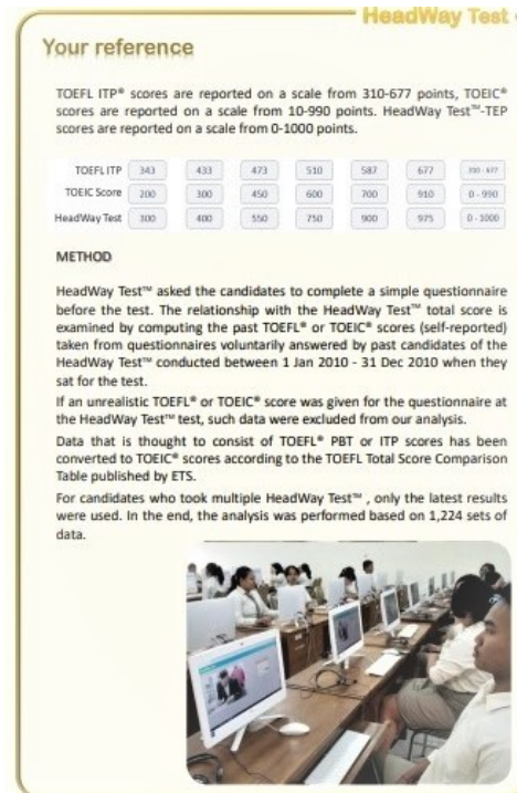
Figure 1. Headway Test conversion

Headways Test asked the candidates to complete a simple questionnaire before the test. The relationship with the Headways Test total score is examined by computing the past TOEFL or TOEIC scores (self-reported) taken from questionnaires voluntarily answered by past candidates of the Headways Test conducted between 1 Jan 2010 - 31 Dec 2010 when they sat for the test. If an unrealistic TOEFL or TOEIC score was given for the questionnaire at the Headways Test test, such data were excluded from our analysis. Data that is thought to consist of TOEFL PBT or ITP scores has been converted to TOEIC scores according to the TOEFL Total Score Comparison Table published by ETS. For candidates who took multiple HeadWay Test, only the latest results were used. In the end, the analysis was performed based on 1,224 sets of data.